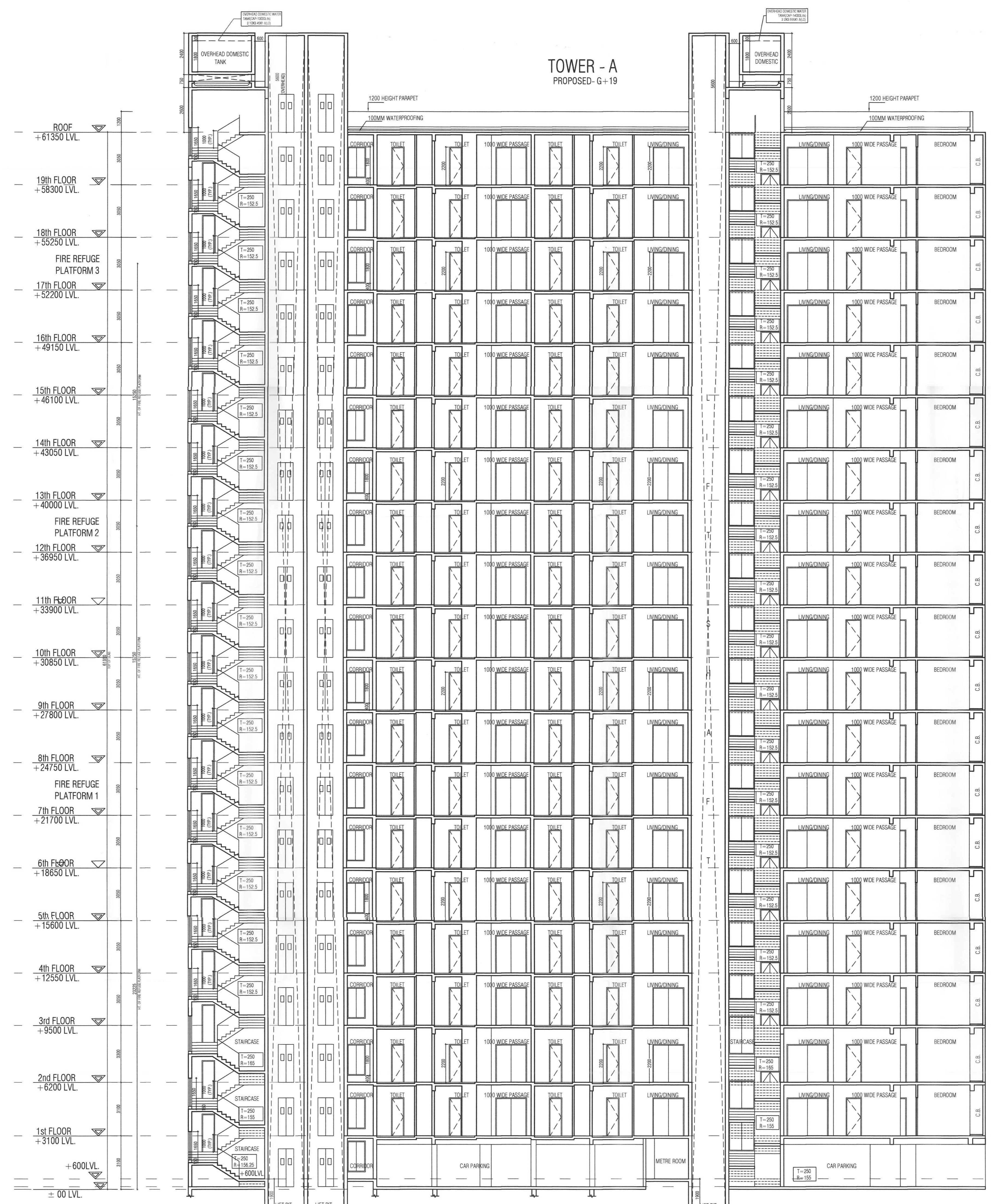
SECTION - DD SCALE: 1:100